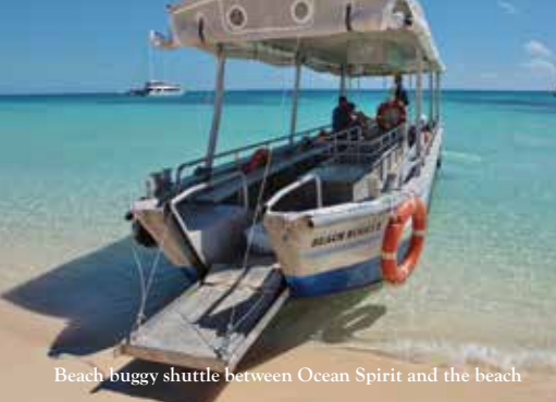
Beach buggy shuttle between Ocean Spirit and the beach