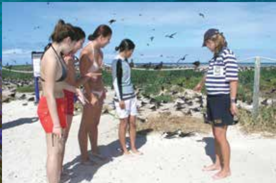
Observe the island bird life