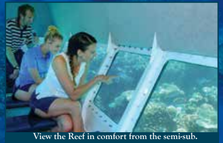
View the Reef in comfort from the semi-sub.