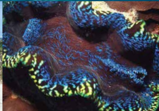
Michaelmas reef is renowned for an abundance of giant clams