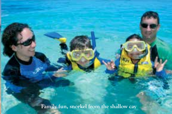
Family fun, snorkel from the shallow cay