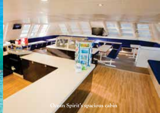
Ocean Spirit's spacious cabin