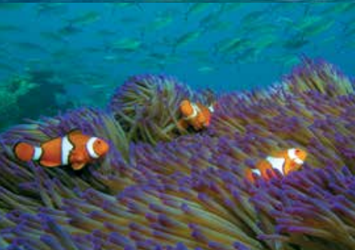
A colourful underwater world to explore